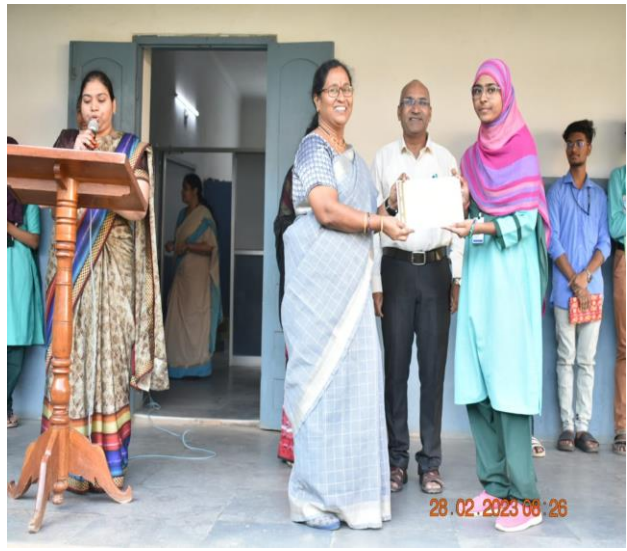
II Year Students