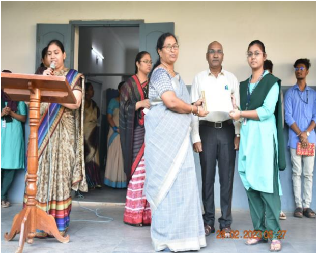
I Year Students